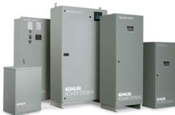
(Various Kohler Transfer Switches)